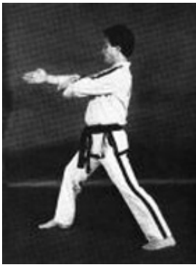
16. Move the right foot to E forming a right walking stance toward E while executing a middle thrust to E with the right straight finger tip.