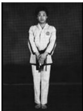
Closed ready stance C toward D.