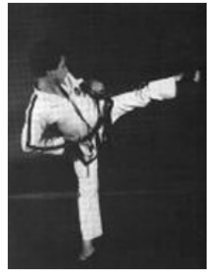
19. Execute a high turning kick to CF with the left foot and then lower it to F forming a right L-stance toward F while executing a middle guarding block to F with a knife-hand. Perform 18 and 19 in a fast motion.