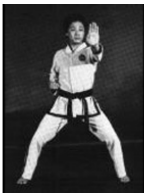
1. Move the left foot to B to form a sitting stance toward D while executing a middle pushing block to D with the left palm.