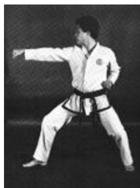
6. Execute a middle punch to A with the right fist while forming a right fixed stance toward A in a sliding motion.