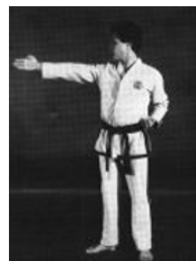
7. Execute a downward strike with the right knife-hand while forming a left vertical stance toward A, pulling the right foot.