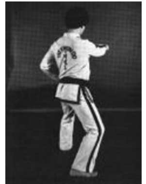
23. Move the left foot to C forming a right L-stance toward C while executing a middle punch to C with the right fist.