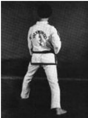
20. Move the left foot to C forming a left walking stance toward C while executing a low block to C with the left forearm.