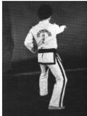
21. Execute a middle punch to C with the right fist while forming a right L-stance toward C, pulling the left foot.