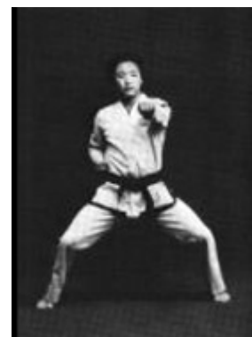
3. Execute a middle punch to D with the left fist while maintaining a sitting stance toward D.