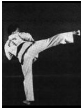
18. Execute a high turning kick to DF with the right foot and then lower it to F.