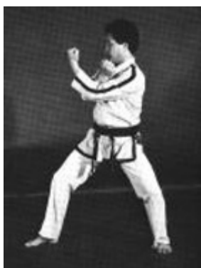
5. Execute an upward punch with the left fist while pulling the right side fist in front of the left shoulder, maintaining a left L-stance toward A.