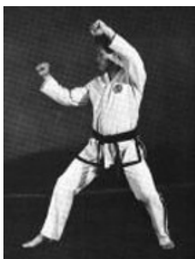
4. Execute a twin forearm block while forming a left L-stance toward A, pivoting with the left foot.