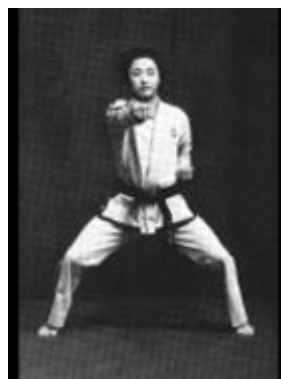
2. Execute a middle punch to D with the right fist while maintaining a sitting stance toward D.