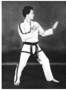
17. Move the right foot on line EF forming a right L-stance toward F while executing a middle guarding block to F with a knife-hand.