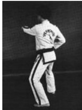
22. Move the right foot to C forming a left L-stance toward C while executing a middle punch to C with the left fist.